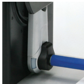
Colored LED indicator provides rewriter operation status