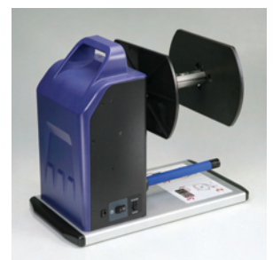
Stylish appearance plus a rugged design for long term reliability