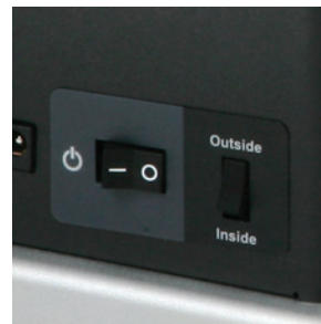
Rewinding direction switch to rewind "inside or outside" label rolls